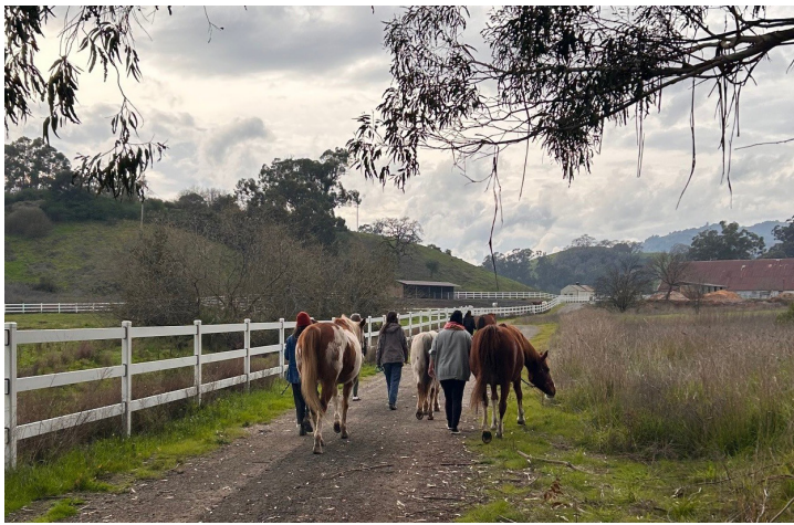
Above: Clients build skills through horsemanship at Eagleson Equestrian Center. Right: CCSF staff prepare bags of groceries for delivery to clients during the holidays.