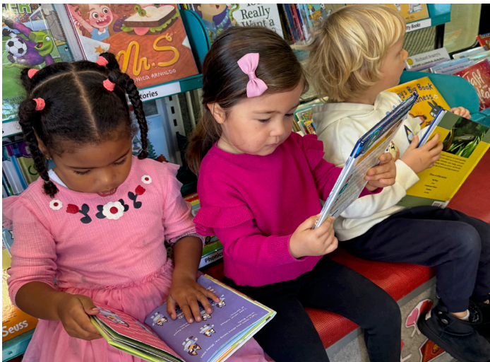
Above: Kids at TICDC enjoy a visit from the SF Public Library Bookmobile.

At Catholic Charities, hope is the thread that connects all of us—programs, clients, staff, volunteers, and donors—together. When a family or individual walks through the doors of one of our programs, we are not just offering them a service—we are providing hope. This hope courses through the heart of all 37 of our programs , our 300+ employees , and the 56,713 individuals we served last year. ■